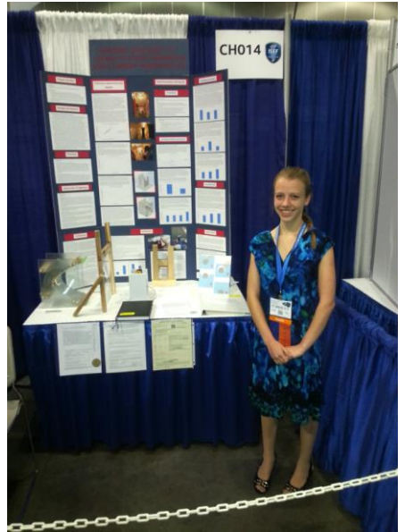
Finalist 2013 & 2014 – Western Suburbs 1st Grand Award in Chemistry, $3000 1<sup>st</sup> Place Chemistry at National JSHS, $12,000 scholarship