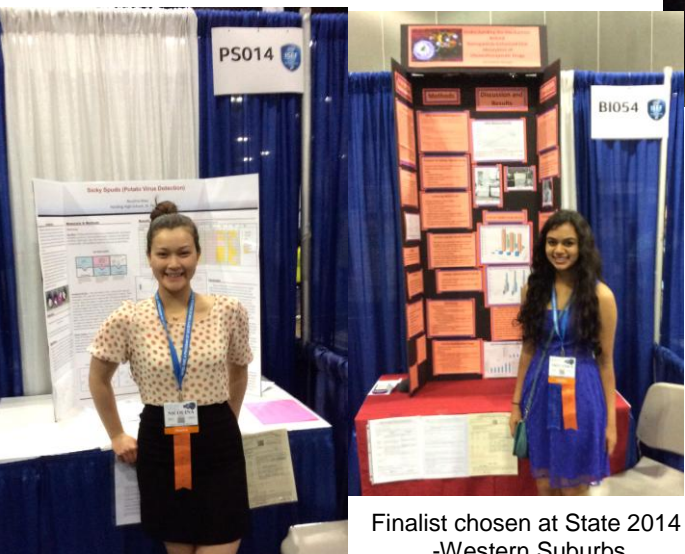
Finalist 2014 – St. Paul