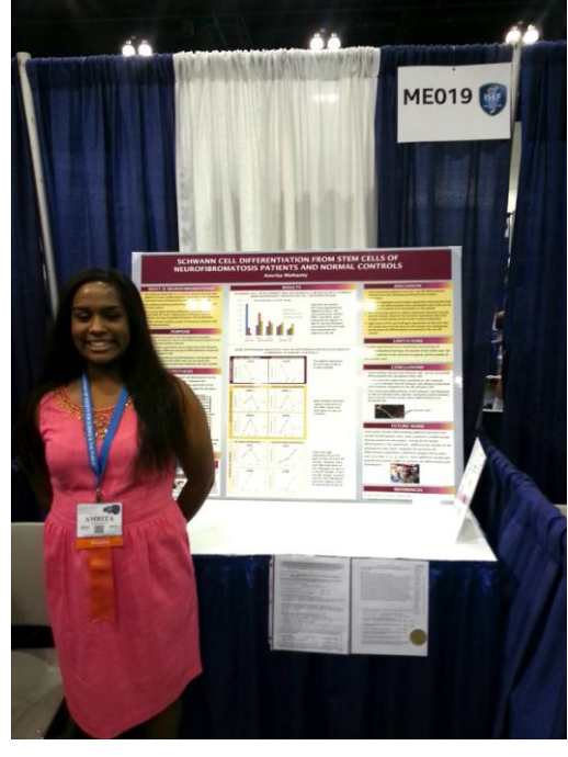
Finalist 2014 - Twin Cities