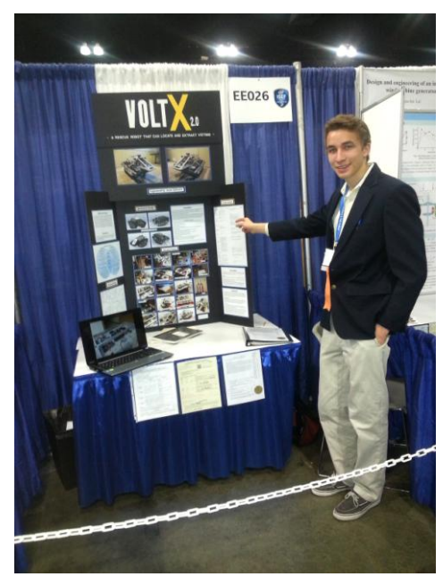
Finalist 2014 – Western Suburbs 3rd Grand Award in Engineering, $1000